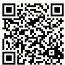
B360 3D demo